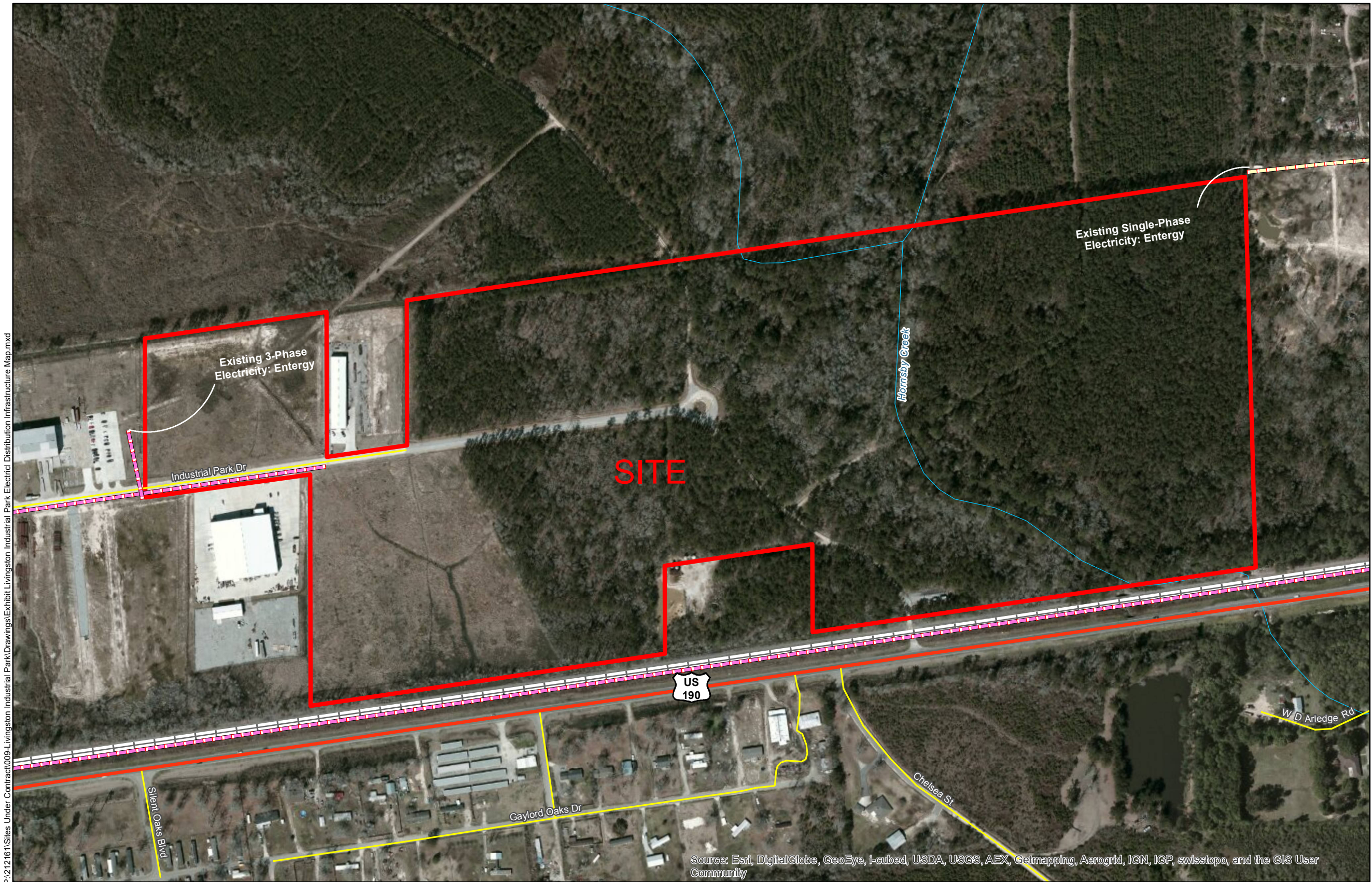
Exhibit O. Livingston Industrial Park Electrical Distribution Infrastructure Map

Project: Livingston Industrial Park Livingston Parish, LA